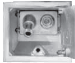
Model 90 Woodford Freezeless