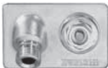
Model 80 Woodford Freezeless

All parts available except deep box castings - Parts same as Y70 Hydrant or Model 70 and 80.