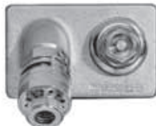
Model 85 Woodford Freezeless Anti-Contamination 34HW Vacuum Breaker (55180 Nozzle Required)